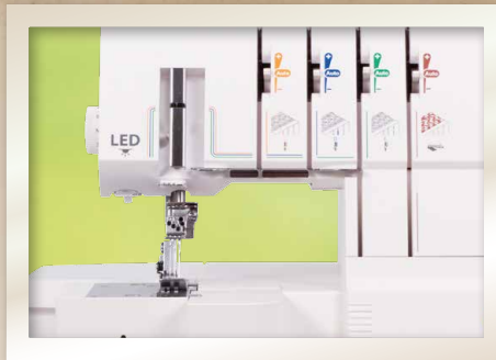
Throat space of 100 mm