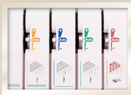
Automatic thread tension control