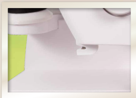
Built-in thread cutter