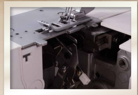
Threader for lower looper