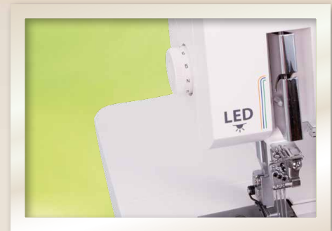
Foot pressure adjustment